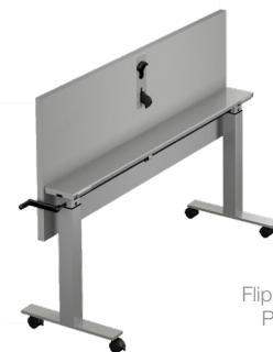
Flip-top option with casters PT22-C3060-ADJ-FT-4C