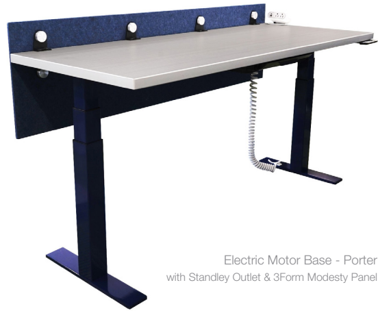
Electric Motor Base - Porter with Standley Outlet & 3Form Modesty Panel