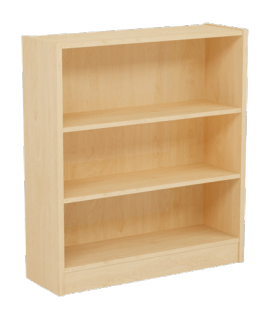
H11-4210 H11-4210A Adder H11-4212 H11-4212A Adder