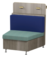
DUO-R35L-CC Right Miter