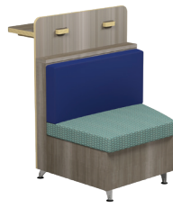
DUO-L35L-CC Left Miter