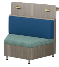
DUO-RL45L-CC Double Miter