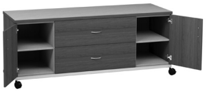
Cupboard with Deep Box Drawer & Lateral File Storage (CSDFSL)