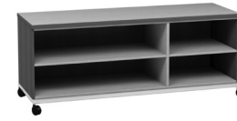
Open Storage Alternate Shelves (OSA)