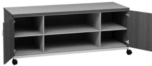
Cupboard with Open Storage (CSOS)