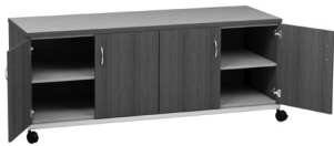
Cupboard Storage (CS)