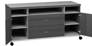
Cupboard with 2 Lateral File Storage Drawers (CS2FSL)