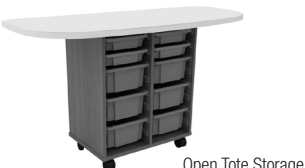
Open Tote Storage