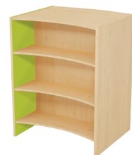
Shown with LamWow Laminate Accent Panel

Heights available: 42" H 48" H 60" H 72" H