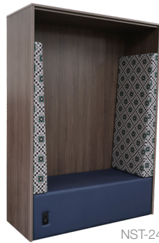
NST-2448L-84 Nest with back and Fully upholstered base shown with Duet connectivity option.