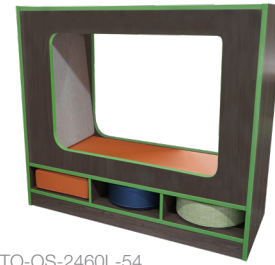
NSTO-OS-2460L-54 Open Nest with Storage base