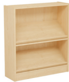
H11-4212 plus (2) H11-12SH-MAG Magazine Shelves