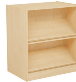
H11-4820 plus (4) H11-12SH-MAG Magazine Shelves