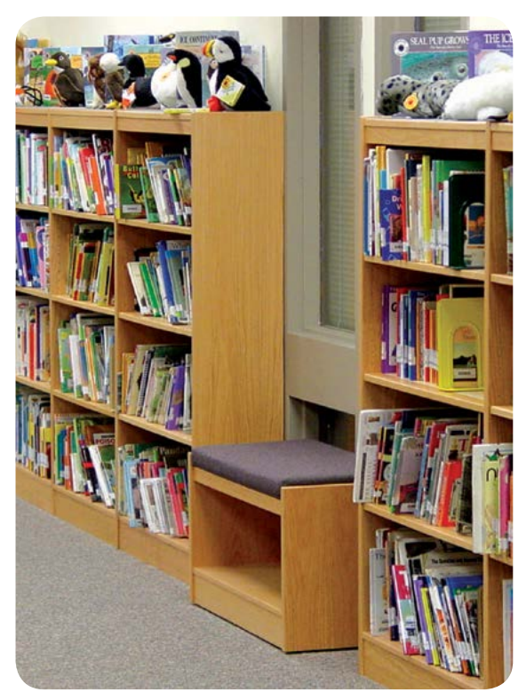
A bookstack seat nestled between bookcases in an elementary school application.