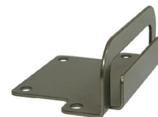
Table Side Mounting Bracket