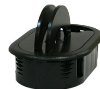
Table Top Mounting Bracket