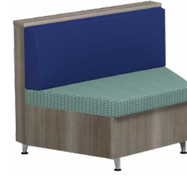
DUO-RL45 Double Miter