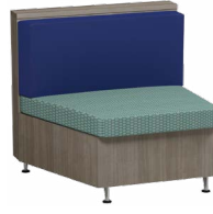
DUO-R35 Right Miter