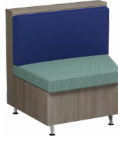
DUO-L35 Left Miter