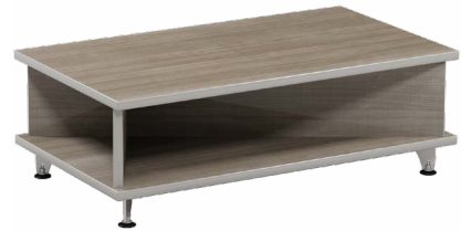
DUO-2442OT-14 Rectangle *Not available with power option