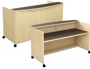
ID-72-42 72" Rear Desk Unit