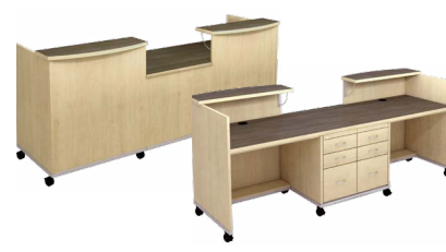
ID-102-42 102" Rear Desk Unit