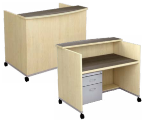
ID-48-42 72" Rear Desk Unit