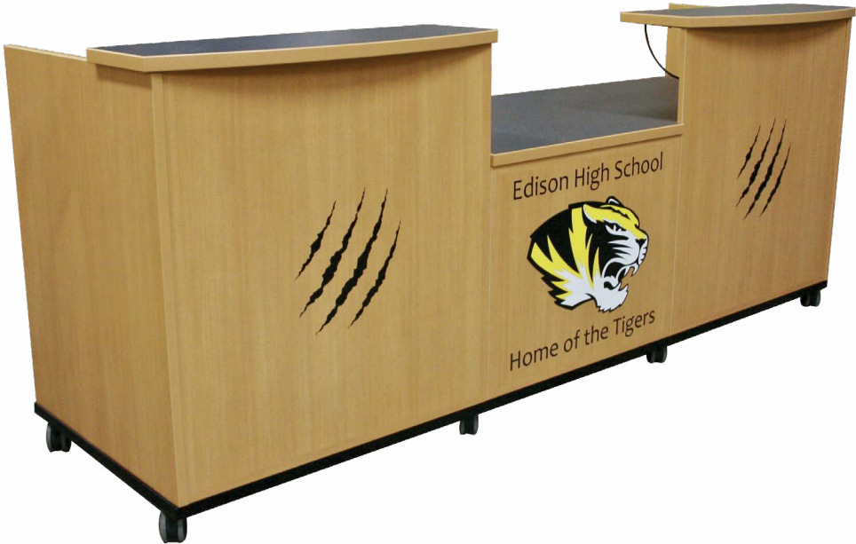
ID-E102 Shown with custom graphic