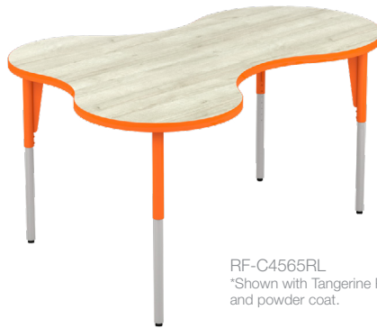
RF-C4565RL *Shown with Tangerine PVC Edge and powder coat.