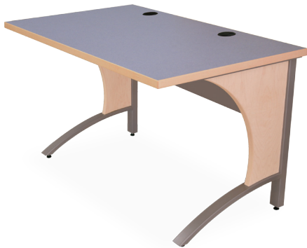
Cirrus Computer CSC-E3060-29 shown with veneer modesty panel and wire management trough