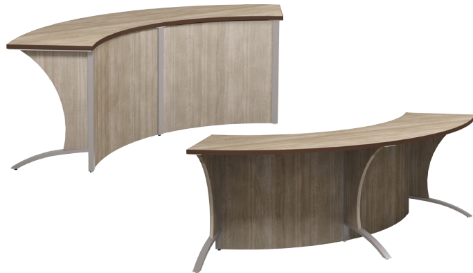
Representational image of Curved Cirrus CS-C2496-CRV-29