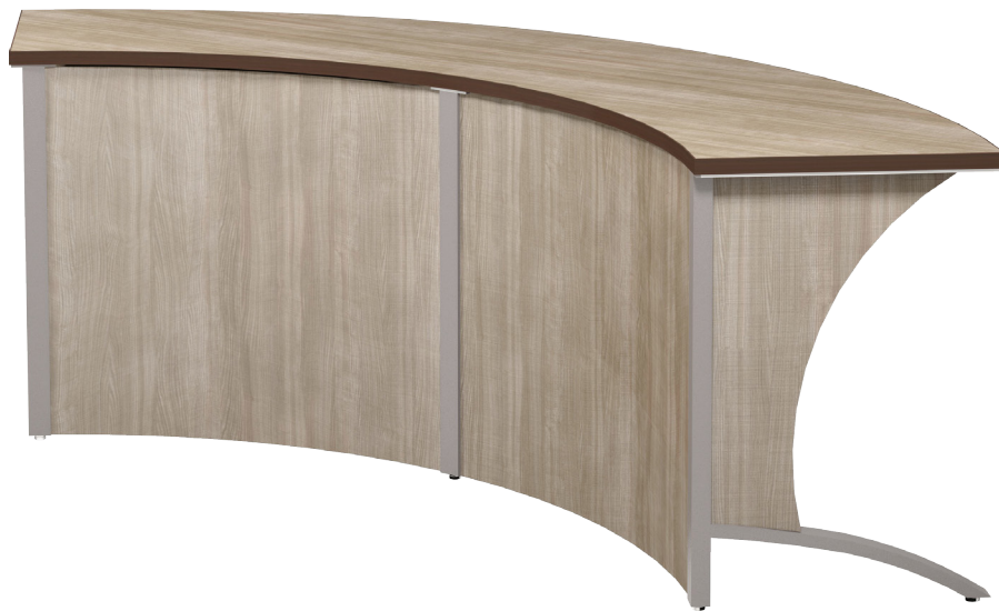
CS-E3060V above and CS-C2496-60CRV-29 below