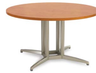
D4X38-F0060-29 NO Panel Base