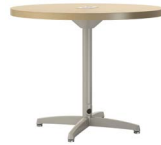
DX33-C0042-29-P Wire Management Base