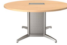
D4XPB38-F0060-29 Panel Base