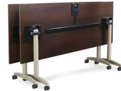
Flip Top-T-Base, Mobile