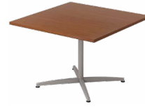
DX38-E4242-29 NO Panel Base