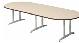
DTT40-LRT6072-29 Racetrack-TT Base