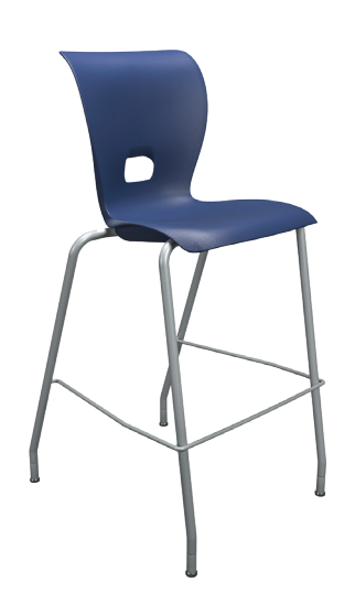
Shelby, 4-Leg Cafe Stool SCS-30-NG-809