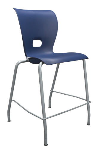
Shelby, 4-Leg Counter Stool SCS-24-NG-809