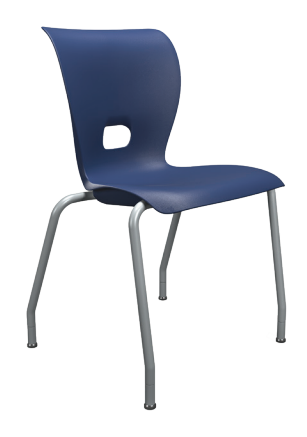
Shelby, 4-Leg Stacker, 18"H SC4-18-NG-809